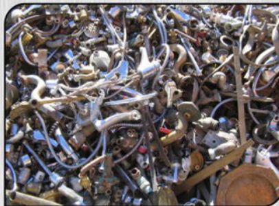
BRASS HONEY SCRAP