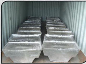
LEAD JUMBO INGOTS