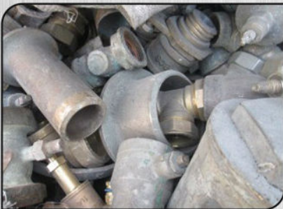
BRASS HEAVY SCRAP

Brass is a non-ferrous and non-magnetic metal. With its ability to be easily re melted back to its original state without losing any properties, around 90% of all Brass Alloys being produced globally are recycled brass scrap metal.