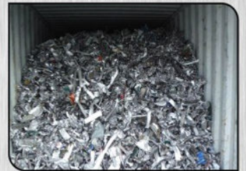
TAINTABOR-CUT & SHEARED