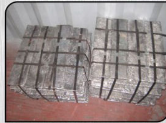
LEAD REMELTED INGOTS