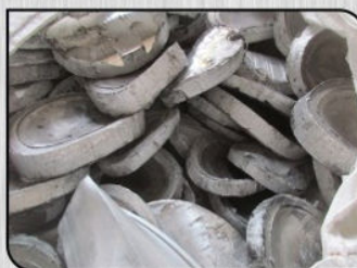
BILLET ENDS CUTTINGS