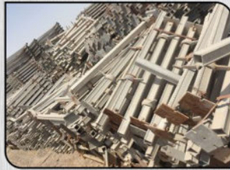
TREAD 6061- LOOSE

Aluminium is a non-ferrous and non-magnetic 100% recyclable metal. Physical properties of Aluminium scrap metal are not lost during the recycling process, and it can be recycled indefinitely with more than a third of all Aluminium produced globally originating from recycled scrap metal. All Aluminium scrap metal processed at Shredmet form is sorted and categorised prior to export into internationally recognised grades.