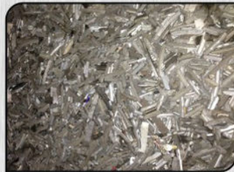
LEAD WHEEL WEIGHTS