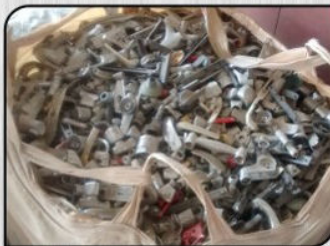
ZINC DIE CAST SCRAP